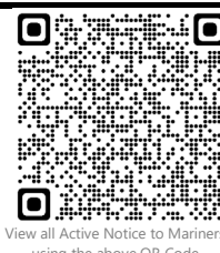
View all Active Notice to Mariners using the above QR Code

Telephone calls, VHF radio traffic, CCTV and radar traffic images may be recorded in the VTS Centres at Gravesend and Woolwich